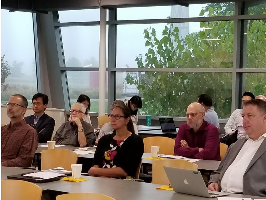
Students, faculty, and member company representatives hear portfolio updates at WMU's College of Engineering and Applied Sciences

The Agenda 2020 Technology Alliance is an industry-led consortium that promotes development of advanced technologies for the pulp and paper industry. For further information, please visit the website at www.Agenda2020.org .